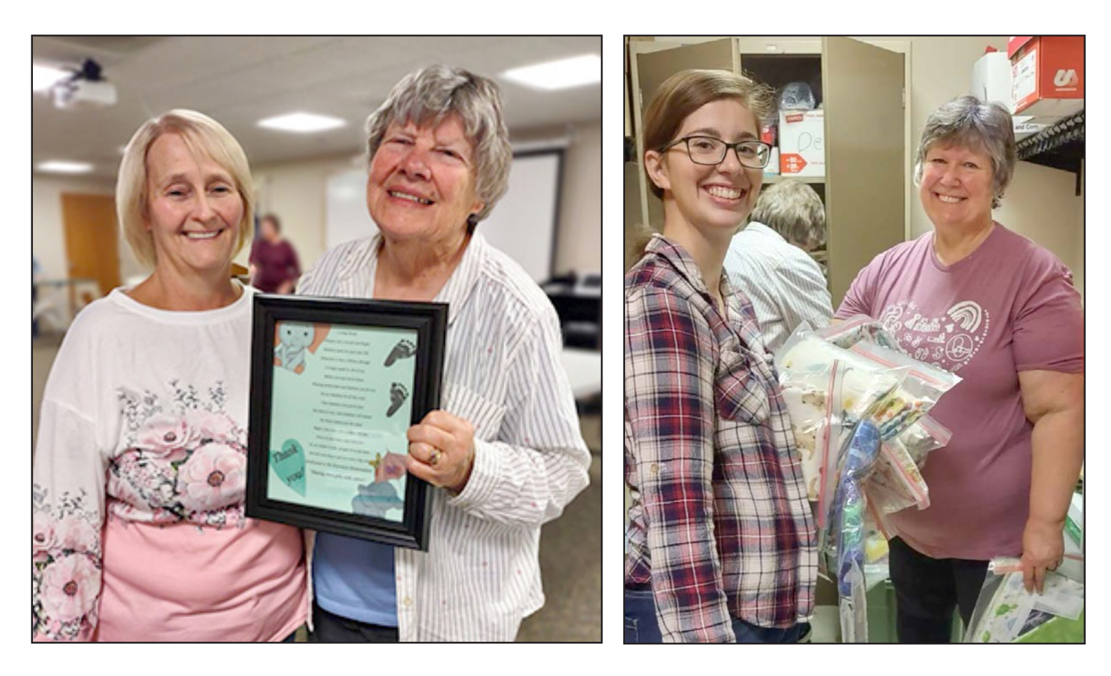
www.extension.purdue.edu/dekalb • November/December 2023

Nurses from Parkview DeKalb family Birthing Center came to the Homemakers September Sew Day. They wanted to show their appreciation for over the last 20 years we have donated an average of 25 baby blankets monthly. They presented the ladies with flowers, Cookies and dessert, plus a wonderful poem. We are able to do this through our fall dinners and many donations We will continue making the blankets giving them away in different ways.