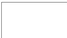
HORIZONTAL (HOW YOU SLEEP)