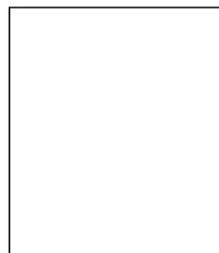
VERTICAL (HOW YOU STAND)

backing the same size as the poster, and poster board alone is not acceptable.