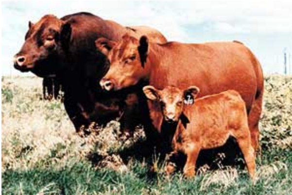
Red Angus _____