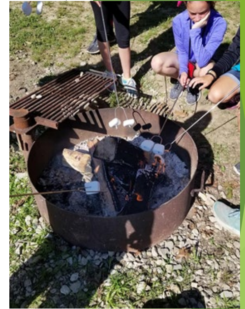
Outdoor cooking is always a must!