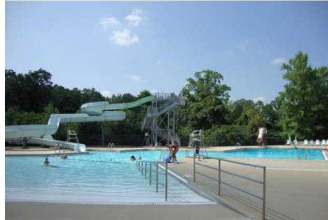
Shakamak has a public pool in their park. The camp walks over the pool each day to go swimming for a few hours. Lifeguards are also on duty.