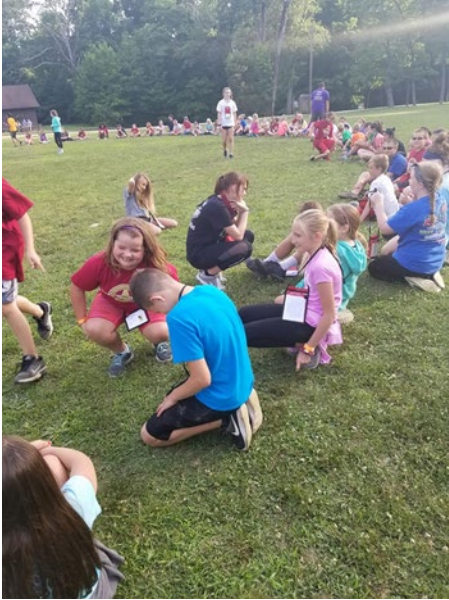
Games with the whole camp in attendance!