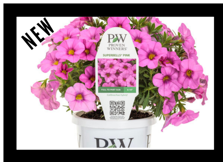
PINK Calibrachoa Comes in Basket Form