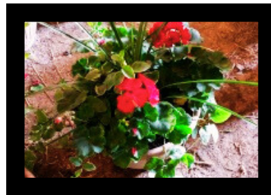
Geranium Patio Planter