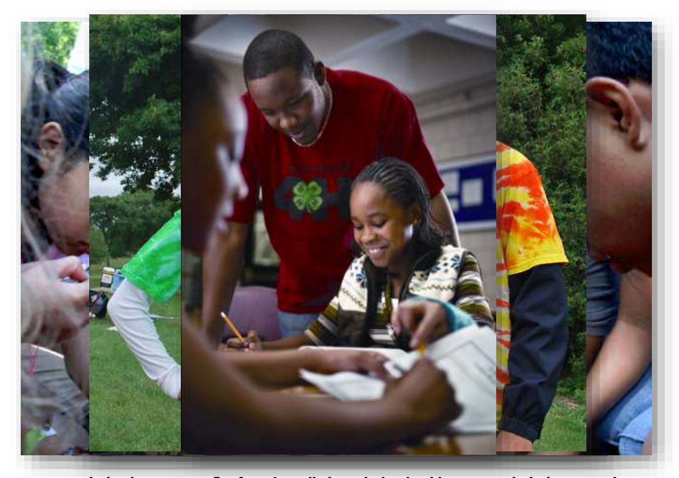
Bespicthidistaleathy the toghte ballein policein policein a lunity