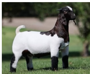
Exhibit Hall Project Changes