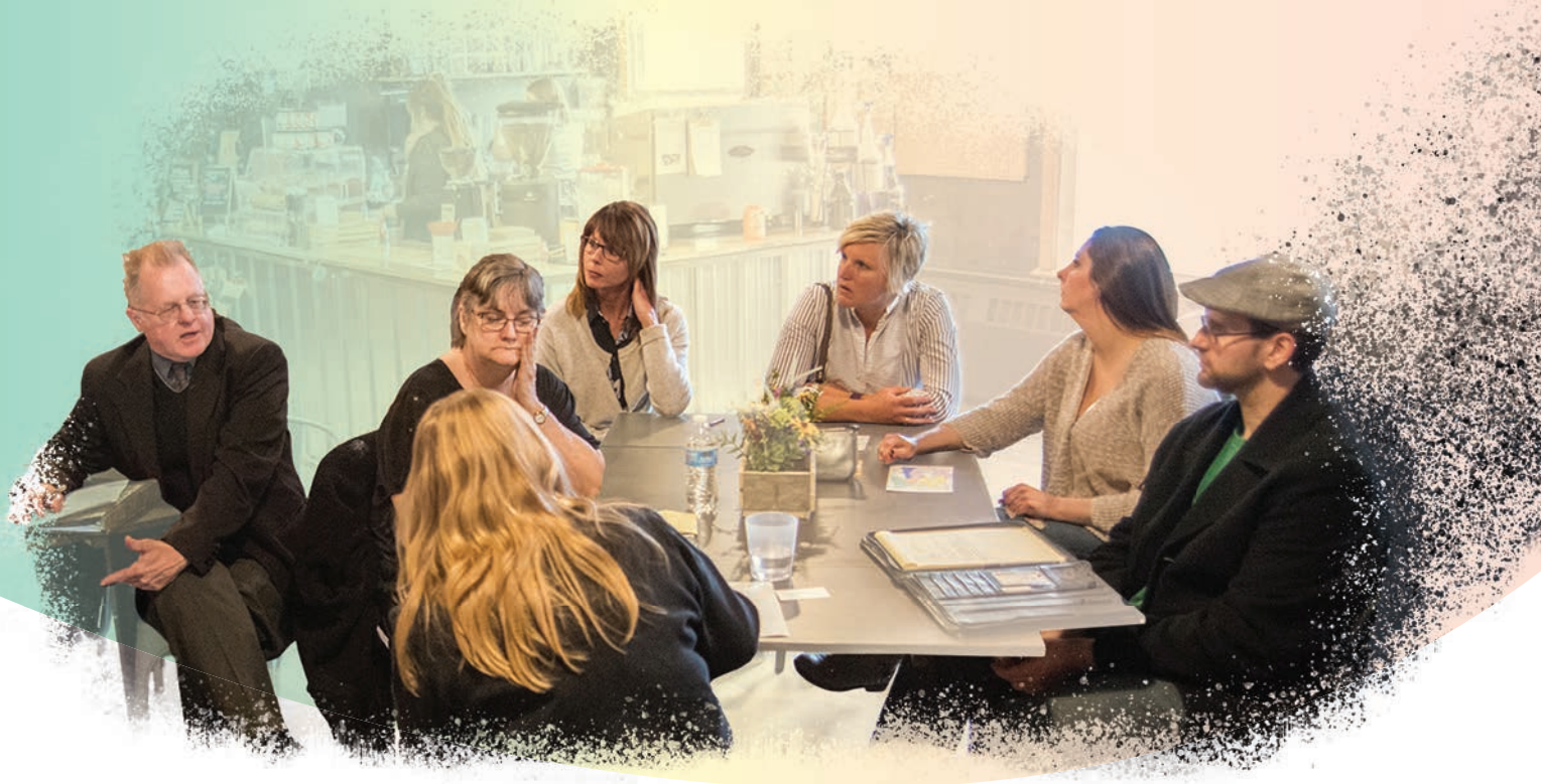
Logansport residents discuss how to build on the community's assets.