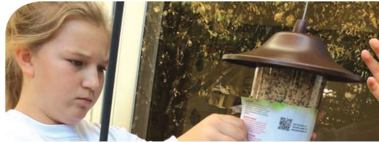
Third-grade students at Lincoln Elementary in Bedford maintain school garden beds, an orchard and a butterfly habitat while participating in The Nature of Teaching program.

Lessons in gardening inspired the 21-year teaching veteran to develop local partnerships and secure grants that helped establish the school courtyard garden and