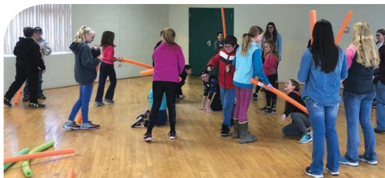
Perry County students participate in team-building exercises and sheep shearing as part of their 4-H Youth for the Quality Care of Animals training.

"We did some really cool hands-on activities to supplement the YQCA PowerPoint," Boerste says. "Doing the activities makes the program more interesting for the kids."