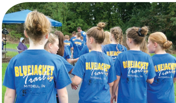
The fitness course in Seymour, Jackson County (right), was built with funds from a variety of sources, including the CDC grant. The Bluejacket Trail (above) in Lawrence County connects 2.6 miles of sidewalks and trails.

“Purdue Extension walked us through the process and helped us out tremendously with getting all the exercise