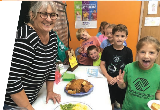
Volunteers from the Morgan County Master Gardeners share lessons on gardening and preparing food with children from the Boys & Girls Club in Mooresville.

190 Master Gardener hours volunteered to the program with the Boys & Girls Club of Mooresville.