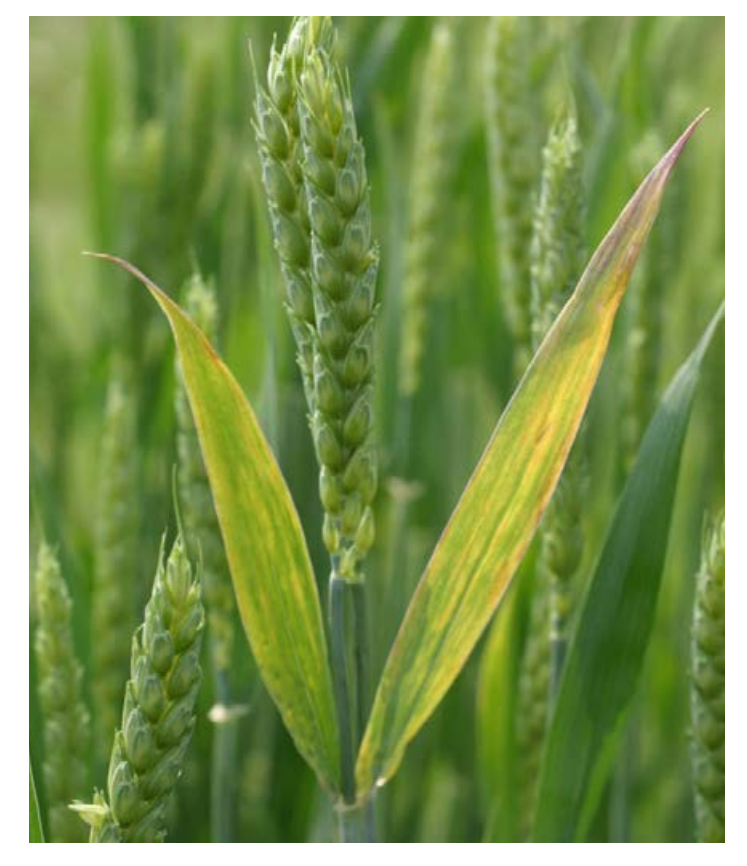
Figure 7. Barley yellow dwarf symptoms on wheat.