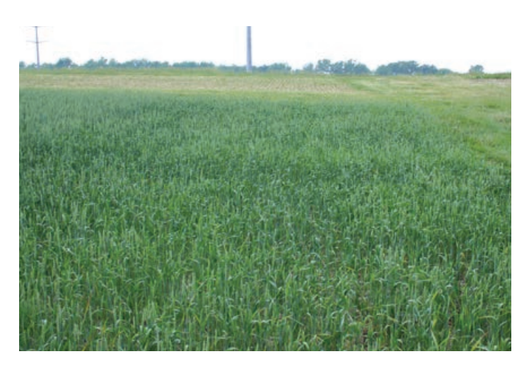
Figure 9. Phosphorus-deficient wheat.

Viruses cause foliar discoloration that is usually mottled or mosaic-like. Nutrient deficiencies cause leaves to turn a uniform pale green or yellow. This coloration may have a gradient from tip to node, but it will not appear splotchy as with virus infections.