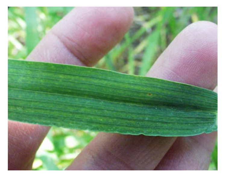
Figure 5. The discoloration of this wheat leaf is caused by wheat streak mosaic virus.

Infections vary in severity depending on the wheat's growth stage at the time of infection and on environmental factors such as temperature and moisture. Warm (75-80°F, 24-27°C), dry weather favors infection by stressing plants and encouraging the proliferation of the virus' primary vector, the wheat curl mite ( Aceria tosichella ). WSMV can also be transmitted mechanically in plant sap, but this is rare.