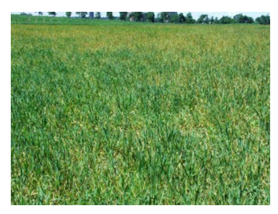
Figure 1. A wheat field infected by barley yellow dwarf virus.