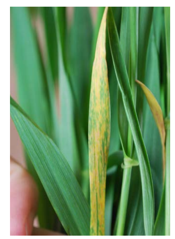
Figure 2. Mottling caused by soilborne wheat mosaic virus.

Wheat infected with soilborne mosaic viruses (WSSMV and SBWMV) may exhibit yellow-green streaks on leaves and plant stunting and/or leaf tip dieback (Figures 2, 3, and 4). SBWMV can cause a rosette symptom in susceptible varieties, which results in excessive production of severely stunted tillers. Researchers also have observed a reddish coloring on lower leaves on wheat plants infected with WSSMV and SBWMV. Plants infected with either virus may produce fewer stems and heads and have fewer kernels (Figure 4).