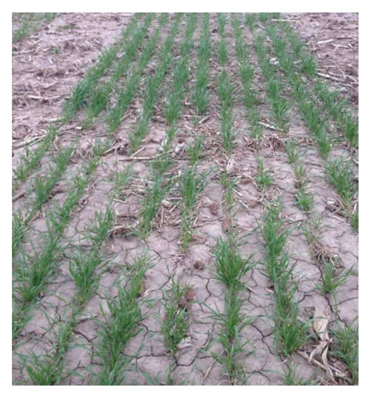
Figure 10. This wheat plot suffered winterkill.

Winterkill symptoms include stunted plants and reduced stand counts (Figure 10). This is most common after winters with prolonged periods of freezing weather.