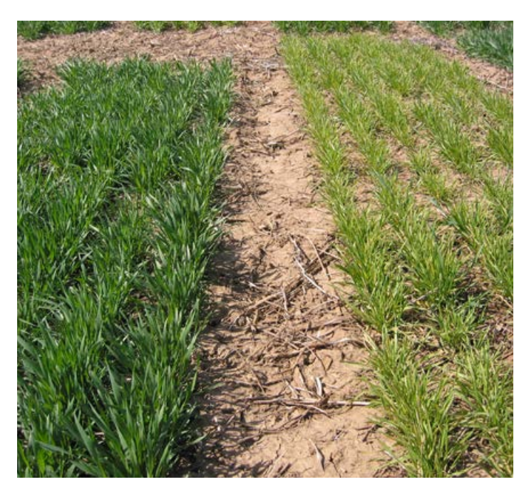
Figure 4. Healthy wheat plants (left) and plants susceptible to soilborne wheat mosaic virus.

SBWMV and WSSMV infect wheat plants in the fall. The soilborne, fungus-like organism Polymyxa graminis transmits both viruses to wheat roots. This organism does not damage wheat by itself, but it enters wheat roots and transmits the viruses to wheat plants.