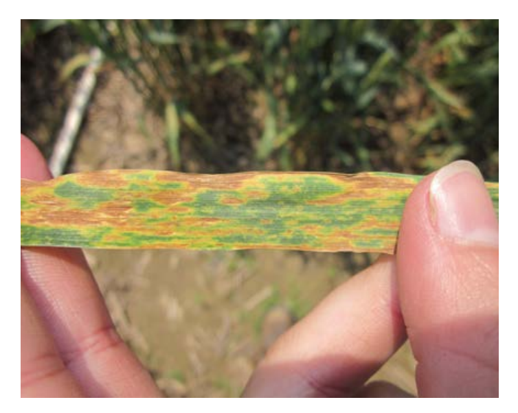
Figure 8. Mixed Septoria and Stagonospora leaf lesions on a wheat leaf.

Septoria leaf spot lesions tend to have wavy, poorly defined edges. Stagonospora lesions have clearly defined edges, often surrounded by a yellow halo.