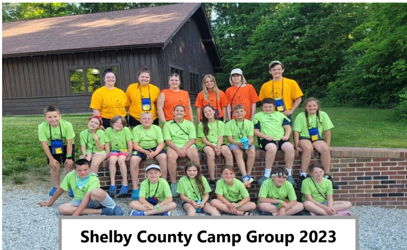
Shelby County Camp Group 2023

It is hard to believe it is already time for the April/May edition of our newsletters! With it getting closer to summer that means 4-H Camp is quickly approaching! If you are in grades 3-6 you have been mailed an application, however another copy is included in this newsletter as well. This is a wonderful opportunity and I highly encourage you to check it out! Camp dates are: May 30 - June 1 at Camp Shakamak State Park in Jasonville, IN. Fee is $100 and includes camp fees, insurance, park admission, t-shirt and transportation. I would like to thank Shelby County 4-H Advisory Council for their generous donation in providing $50 scholarships for each first year