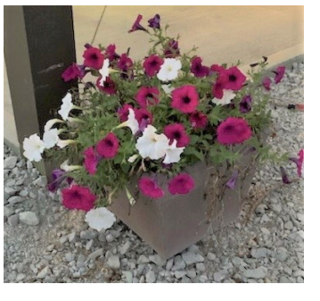
See the attached flyer for more info!

Pick up is the first week of May and determined by your club leader!