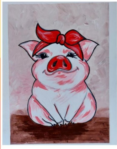
This LIttle Piggy... April 20