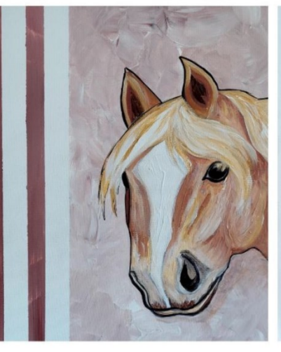
"Fancy" June 15