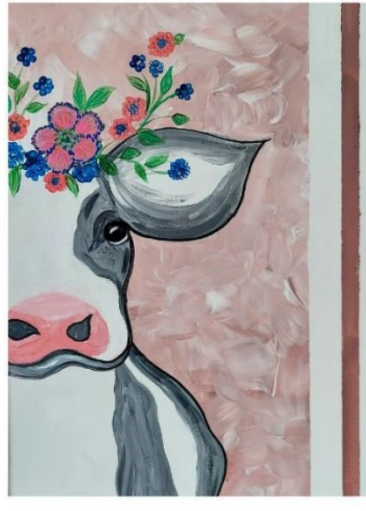
"Buttercup" May 18

Thursdays at 6:30 pm Conference Rooms 1 & 2