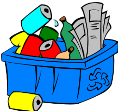
Exhibit an item you have made from recycled materials as outlined in your manual.