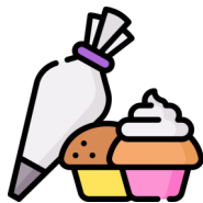
Exhibit three (3) decorated cupcakes OR three (3) decorated cookies on a heavy paper plate.