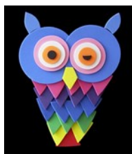
Exhibit one craft item that you have made. Refer to your manual for suggested items or make your own creative craft.