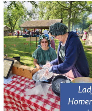
Ladybugs Extension Homemakers Club selling apple fritters at Stones Trace Festival September

Noble County has four Extension Homemaker clubs with 50 members. Their mission is to strengthen families through continuing education, leadership development, and volunteer community support. If your interested in joining one of their clubs, contact the Extension office at 260-636-2111.