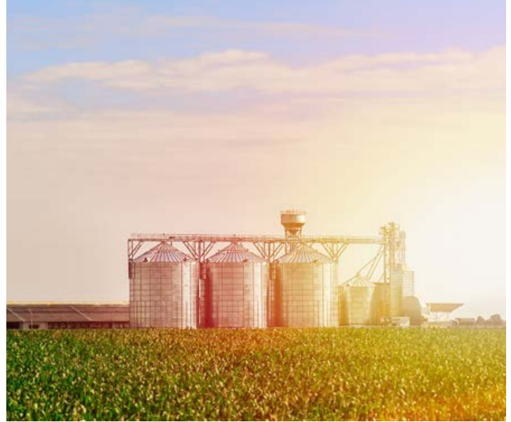
Comprehensive plans often address urban and rural land uses. Consider how engagement techniques will differ with these audiences.