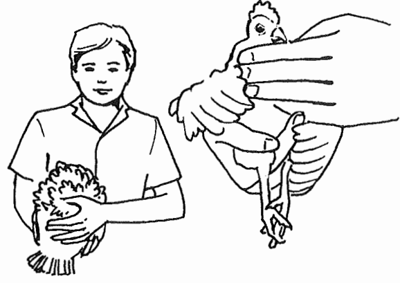
Depth of Abdomen