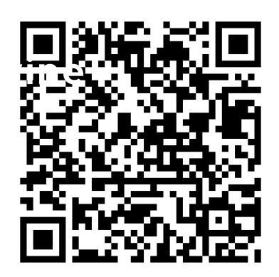
Ripley County Purdue Extension website

There have been some date changes and revisions to our 2024 Ripley County Handbook. As a reminder our handbook can be found on your Ripley County Purdue Extension website at <a href="https://extension.purdue.edu/county/ripley/4h-ripley-county.html">https://extension.purdue.edu/county/ripley/4h-ripley-county.html</a> or paper copies are available at the Extension Office,