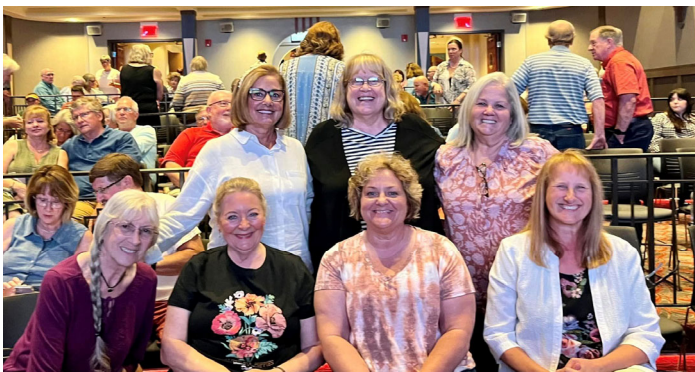
Marshall County Extension Homemakers