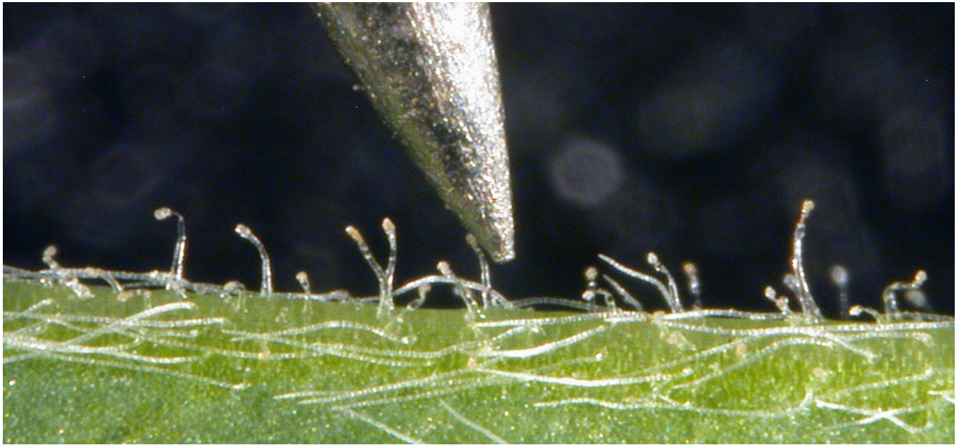
Glandular hairs, next to pin point, of potato leafhopper resistant varieties.